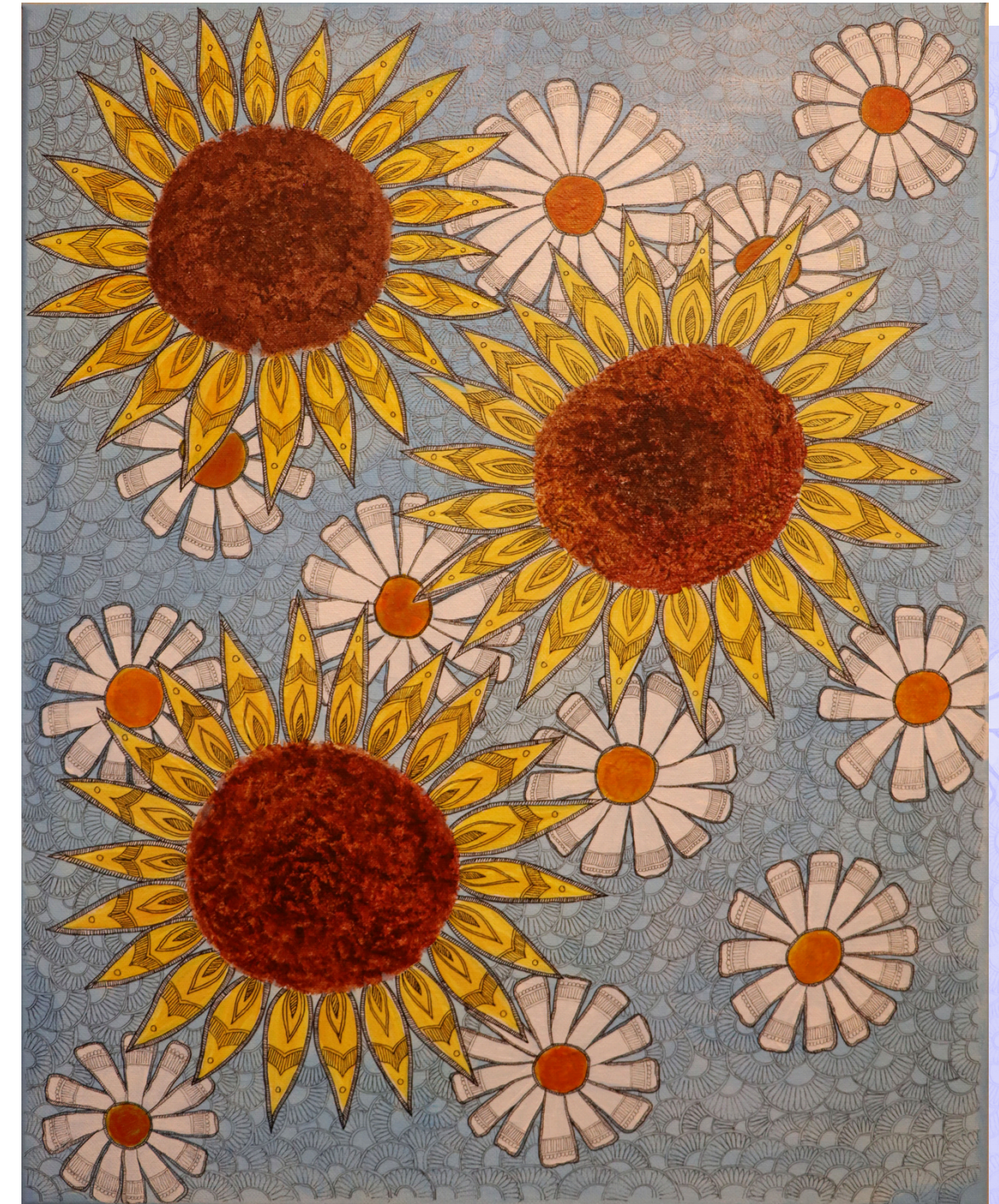
Sunflowers and Chamomiles by Sujatha Balassundaram artresponses.com

Strengthen your people around the world to proclaim the Gospel in the power of the Holy Spirit to see your Kingdom come.